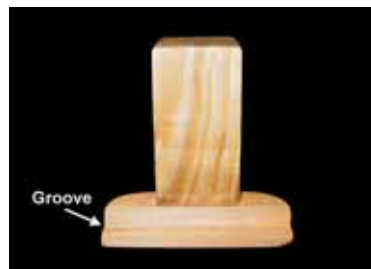
Underside of the sliding block, showing position of edge piece with groove forming a projecting 'lip'.