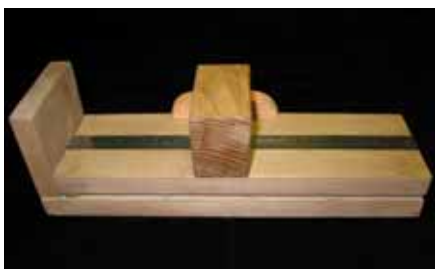
Folded board. The top half is resting on the hinge at one end and on the overlapping part of the upright at the other.