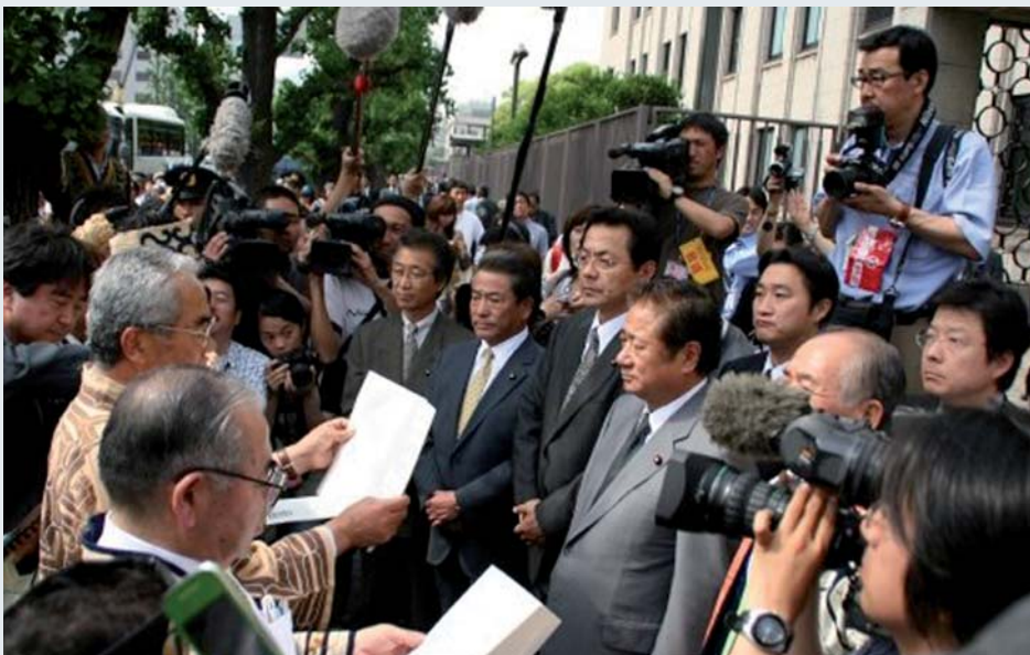
The Chairman and Directors of the Ainu Association of Hokkaido presenting their demands to Hokkaido politicians at a demonstration on 22 May 2008, one month before official recognition as an Indigenous People

In conclusion to my article I argue that, in many respects, this image continues to shape the conceptualization of Ainu politics and society in Japan and abroad today. It also shapes the DPJ government's new policy proposals which ultimately illustrate the complicity between liberal politics and neoliberal governance, particularly as issues of Ainu self-determination are increasingly short-circuited into notions of Ainu self-responsibility.