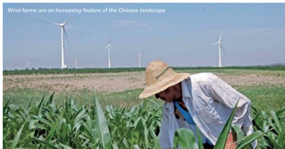
Wind farms are an increasing feature of the Chinese landscape

A reinventing of the wheel, so to speak; yet one that is greener, eco-friendlier, and just as important in shaping our future world.