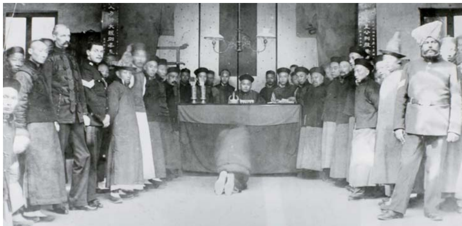
A defendant kneeling in a mixed court room

The one-day workshop was funded by the Higher Education Academy, and included discussion on topics such as the use of on-line resources for teaching Chinese history, China-specific skills-building in teaching, and general challenges and issues facing people who teach Chinese history in institutions which do not have easy access to major library collections and archives such as those which exist in London.