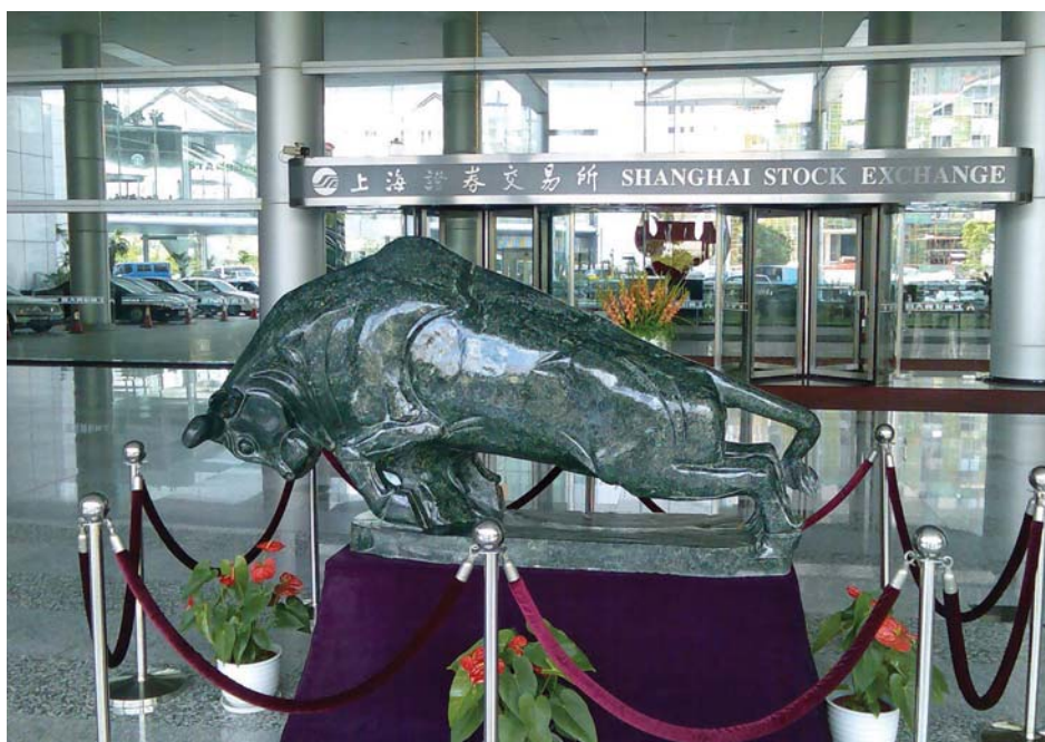
Shanghai Stock Exchange

Lastly, my research touches on the questions of why the market in China could grow at the early stage when investor protection was weak, and why investor protection has been able to improve. My arguments are that the answer to the first question lies in the theories of behavioural finance and the second has much to do with stock market politics.